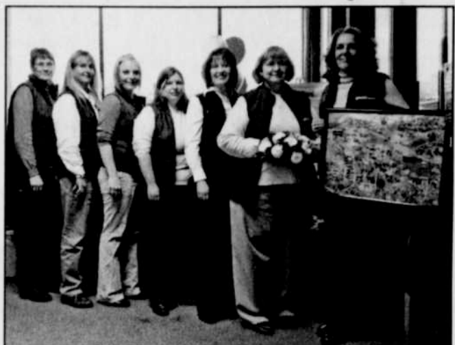
Bank of Eastern Oregon employees celebrated the bank's 65th anniversary on Friday, February 26, at an open house.