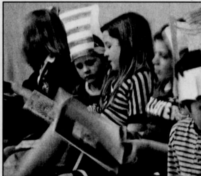
Heppner students celebrate Dr. Seuss' birthday by reading Dr. Seuss books during an assembly at HES.