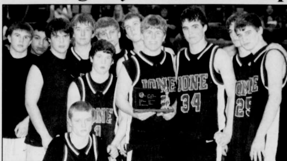
The Ione Cardinals took second place at Big Sky District Tournament this past weekend.