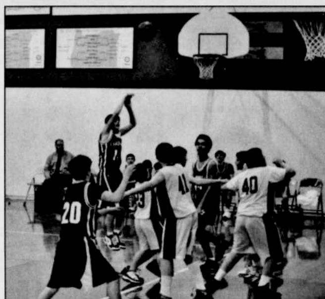
Bottom Photo: Ione Middle School boys team took a win over Condon this past weekend.