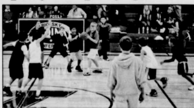
Pictured are K-2nd grade members (Left Photo) and 3rd-5th grade members (Right Photo) of the Ione youth basketball program.