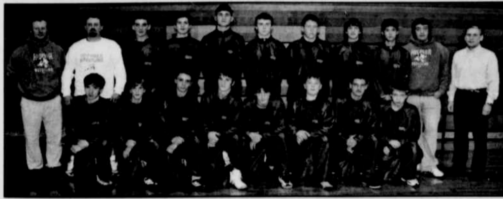
Pictured is the 2009-2010 wrestling team and coaches.

Bank of Eastern Oregon announces the invitees to the Bank of Eastern Oregon 2010 Invitational Wrestling Tournament to be held at Heppner High School on February 6. High schools scheduled to compete are Adrian, Colton, Crane, Enterprise/Wallowa, Grant Union, Heppner, Imbler, Irrigon, Joseph, McLoughlin (JV), Riverside, and Union.