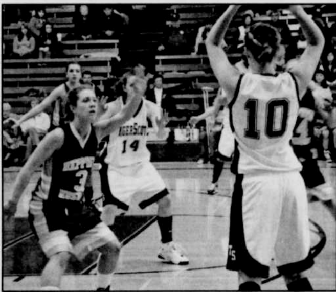
The Heppner Mustangs held on to their perfect conference record with their 45-24 win over Weston-McEwen.