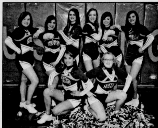
The Heppner High School varsity cheerleaders will hold their 10 th annual dessert auction on Friday, January 29, during half time of both the girls' and boys' varsity basketball games.