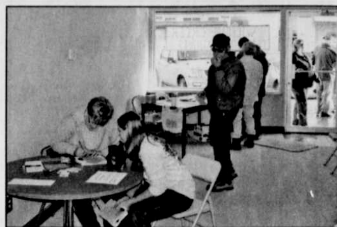
People fill out pink slips at the Willow Creek Tea Party open house last Wednesday in Heppner. The pink slips were then mailed to elected politicians.