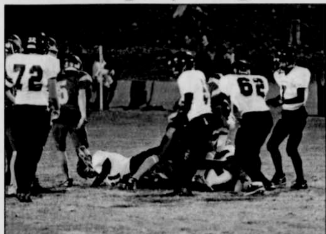
The power of the Heppner Mustangs front line dominated the Enterprise Outlaws in their 48-0 victory Friday night in Heppner. With the victory the Mustangs clinched the Columbia Basin District Title once again and will advance to the first round of the state playoff Saturday in Heppner at 1 p.m.