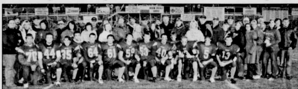
Top Photo: Senior parents were honored at the Mustang football game last Friday night. Right Photo: Senior mothers performed during halftime of the football game.