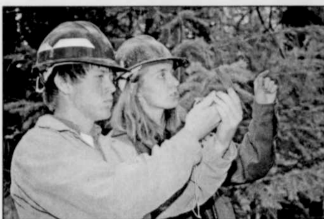
Morrow and Umatilla County high school seniors recently participated in the Heppner Ranger District Fire and Fuels Career Camp. The students spent five days learning about fire and fuels management.

The curriculum is designed to provide a broad exposure to career and educational opportunities, map reading and orienteering, fire ecology and natural