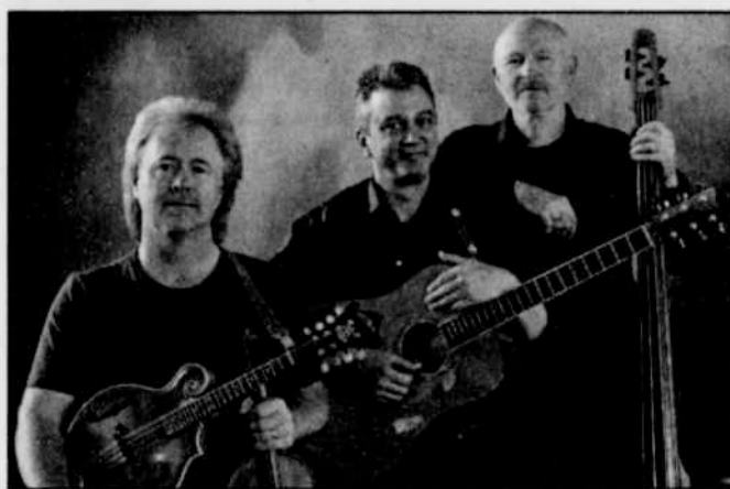
Tiller's Folly will perform at HHS on October 8 beginning at 7 p.m.