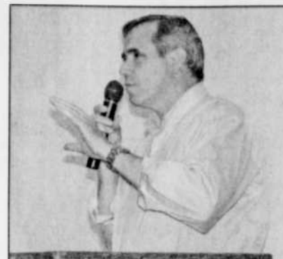
Sen. Jeff Merkley: "Health care costs doubling every six to seven years."