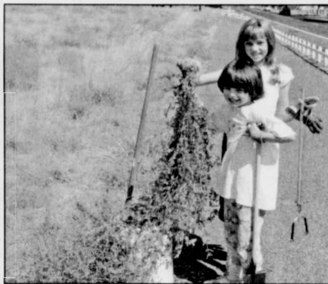
Children from Boardman show off a Puncturevine plant they removed during the city's Puncturevine Control Program

The City of Boardman's new Puncturevine Control Program has been dubbed a huge success with an estimated 2,600 pounds of Puncturevine collected. Each year the city receives complaints of the plant growing along the bike path, sidewalks and curbs. The spiny bur or seed pod from the Puncturevine ( Tribulus terrestris ), also known as a "Goathead", contains 20 seeds equipped with long sharp spines capable of puncturing a bike tire or a shoe.