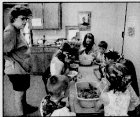
VBS students at Ione Community Church last week.

Flight C winners were: low gross, Burul DeBoer; low net, Luvilla Sonstegard; long drive, Bev Steagall; and K.P., Suzanne Jepsen.