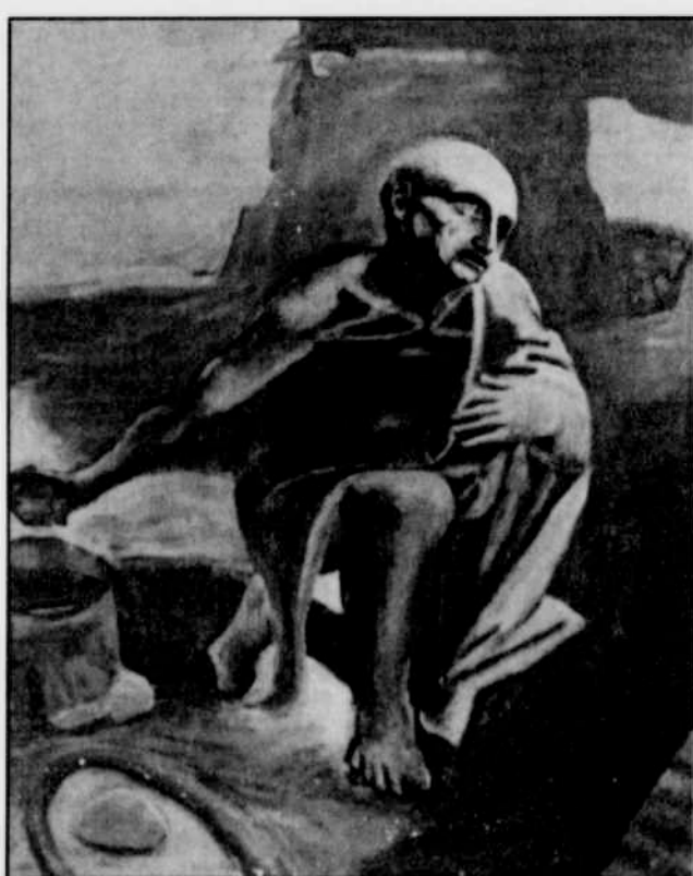
This painting and others are on display at You and I Framing and Gallery in Kenne-