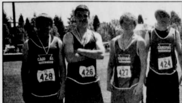
Ione's 4X100 team took fifth place.