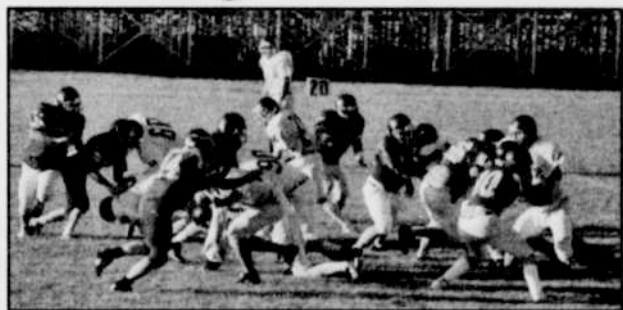
The annual alumni football game will be held June 20.

The third annual alumni football game will be held Saturday, June 20, at 6 p.m.