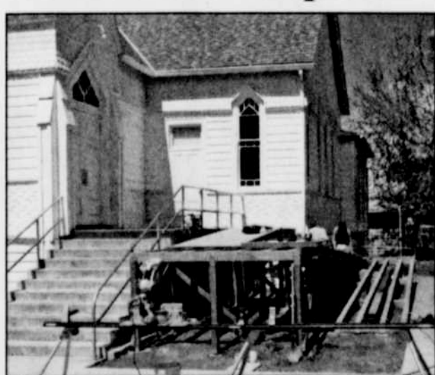
Heppner United Methodist church recently added a wheelchair ramp to their building. Workers recently finished building an attached wheelchair ramp to the church building.