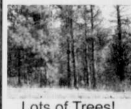
Lots of Trees!