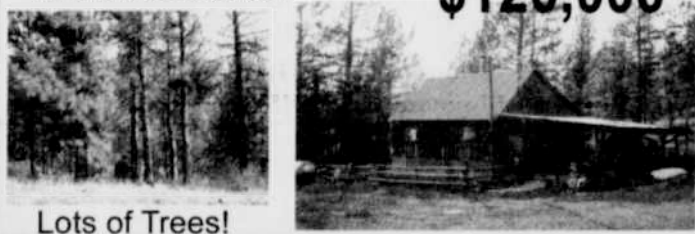
Lots of Trees!