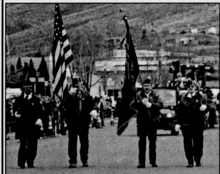
American Legion members march in the Great Green Parade in Heppner.

The American Legion was chartered by the U.S. Congress as a patriotic mutual help wartime veterans' organization of U.S. Armed Forces who served during wartime.