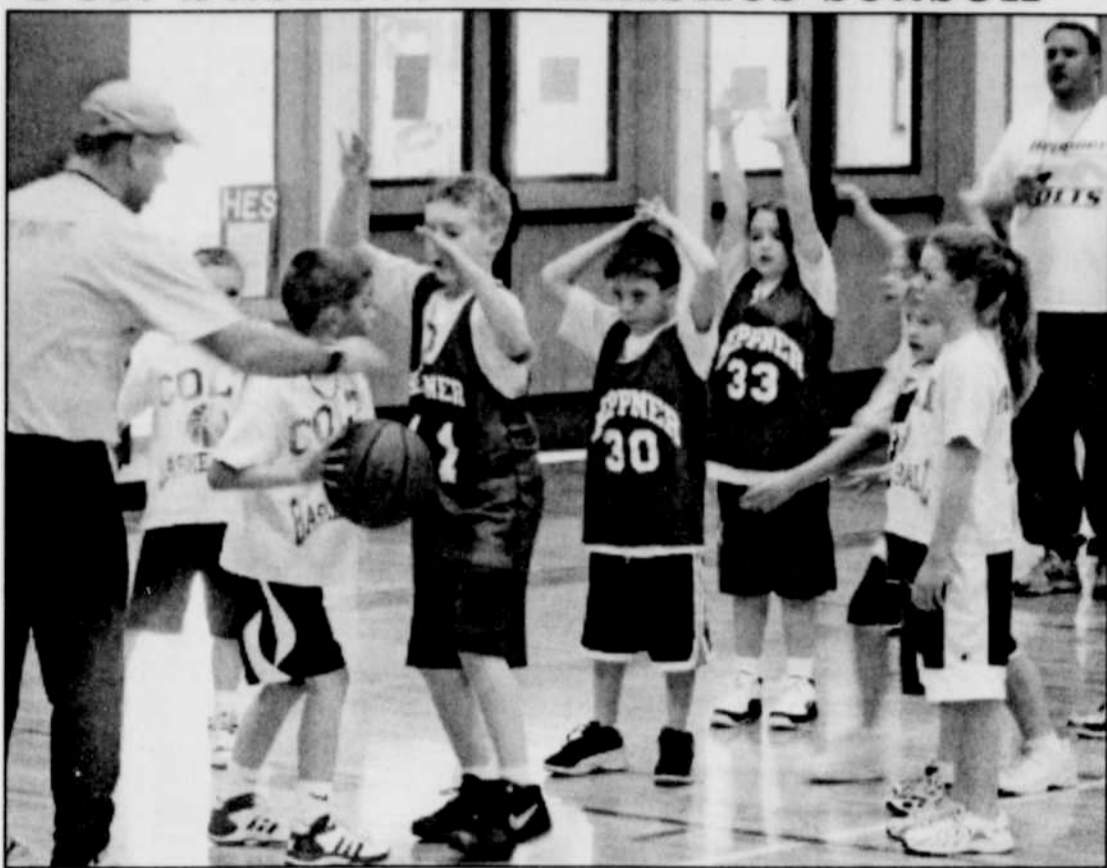
Colt basketball finished their season with a "round robin tournament" at Heppner Elementary School.