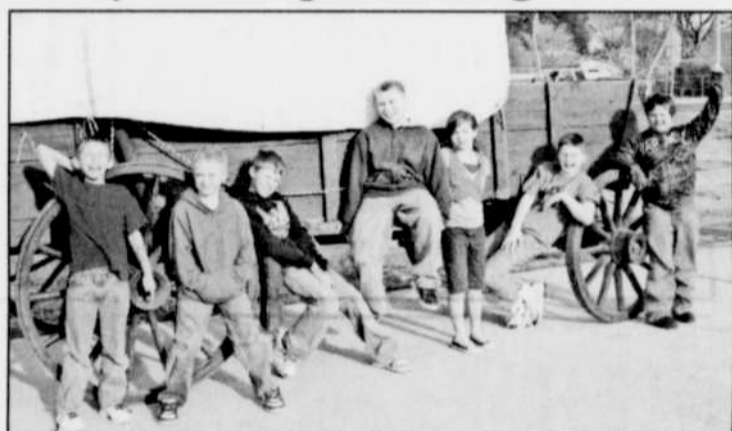
The theme for Heppner Elementary PTC sponsored dance will be "Celebrate Oregon."

Music will be provided by Desert Music Mobile and will feature music of the wagon trail days. The dance begins at 6:30 and goes until 9:30. Students must be accompanied by an adult.