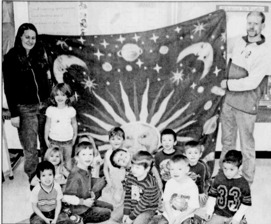
The children at Heppner Head Start are raffling off a queen-sized blanket. The cost of the tickets are $1 each or six for $5 and can be purchase tickets at Artisan Village (where the blanket is on display), Lott's Electric, or from any Head Start parent. The winner will be announced during the St. Patrick's Parade. For additional information call Matt Best 676-5127.