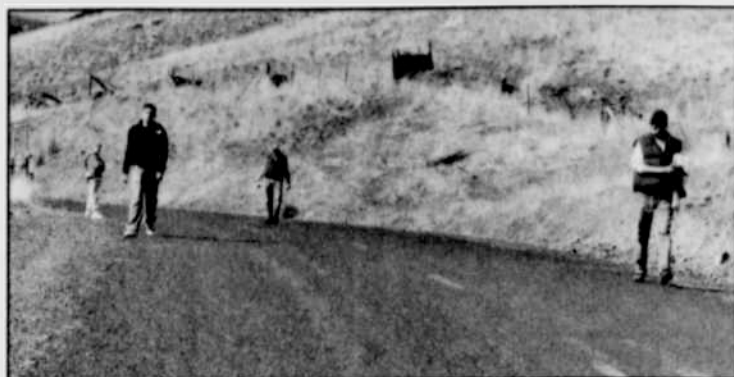
The Road Bowling Trophy, now displayed in the window of Peterson's Jewelers, will feature another group of names after the competition this Sunday. Last year's winners plan to return this year, determined to see their names engraved again on the coveted trophy.

Teams of two to four members compete over a course of approximately one mile by tossing the iron-and-steel "bowls" that