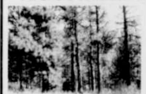
Lots of Trees!

Approx. 15 miles up Willow Creek Rd turn on Black Mountain Lane. New lower Price $120,000