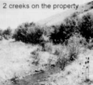
2 creeks on the property

1,608 acre ranch and recreation property $1,280,000