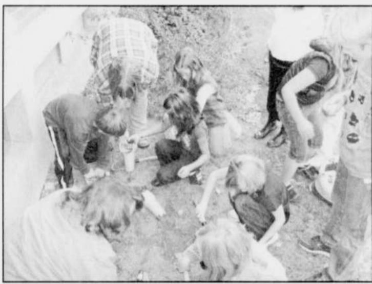
Students at HES plant tulip bulbs during Plant the Promise week last October.

Agenda items include updates on the three county parks, Anson Wright, Cutsforth, and Morrow-Grant OHV Park; election of officers for 2009; scheduled events for this year, and grants update.