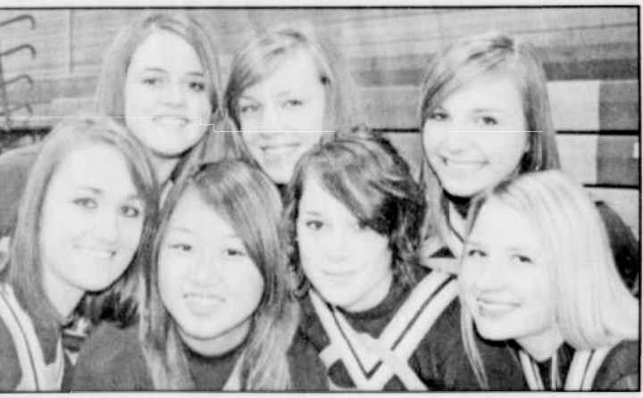
Heppner High School cheerleaders will hold the 9th annual dessert auction on Friday, January 16, at HHS. The auction will be held during halftime of the boys' and girls' games against Enterprise.