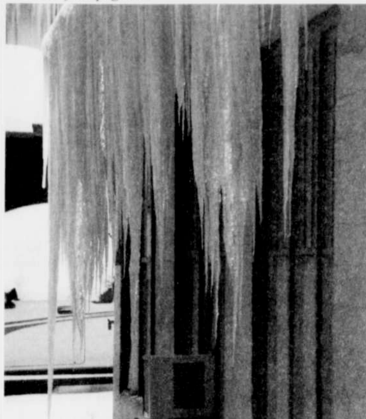
Icicles hang off a building in Heppner