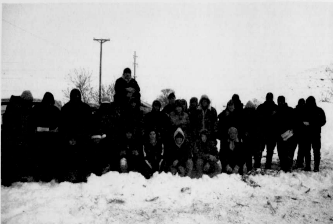
The whole group of "Santa's" helpers pause for a photo