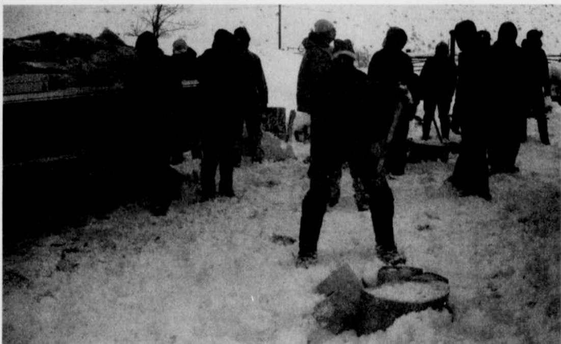
Volunteers work in the chill to deliver split firewood