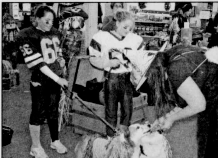
Trick or Treaters made their way throughout Heppner, collecting bagfuls of goodies at various homes.