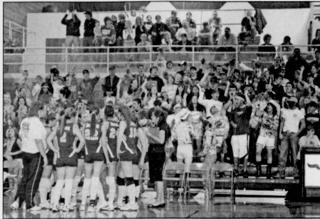
Top Photo: The crowd kept the walls of the gym vibrating with noise and spirit to keep the Mustangs in their game against Lakeview.

This will be a great competition pegged to be one of the best of the tournament. Good luck Mustangs!