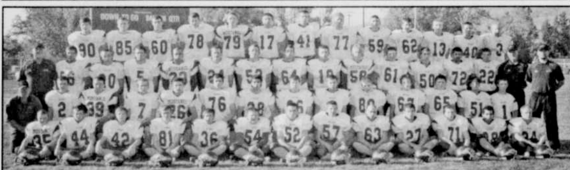
The Heppner volleyball team will be playing at 3:15 p.m. on Friday, November 7 at Pacific University in Forest Grove. The football team will play at home at 1 p.m. on Saturday, November 8.