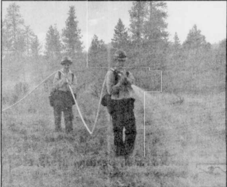
Students from schools throughout the county participated in the Tupper Fire and Fuels Career Camp held last weekend.