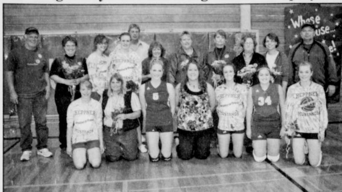
Senior Mustang volleyball players and their parents were recognized during the Weston McEwen game on Thursday, October 16.