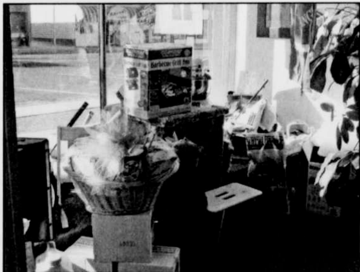
The annual Heppner Booster Club Steak Feed and Auction will be held on Saturday, October 18. Dinner will begin at 6 p.m. and the live auction will begin at 8 p.m. There will also be raffle items and a silent auction.