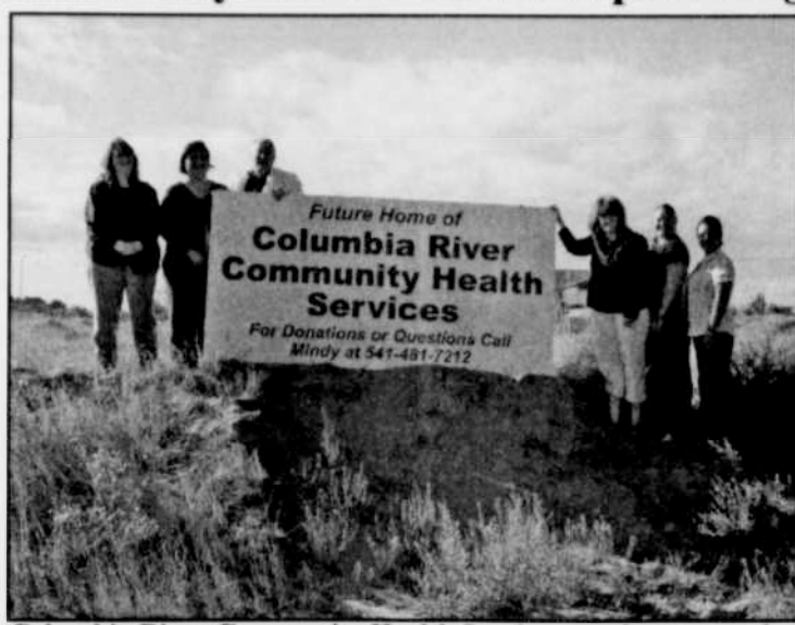
Columbia River Community Health Services employees stand by a sign that marks the site for their new facility.