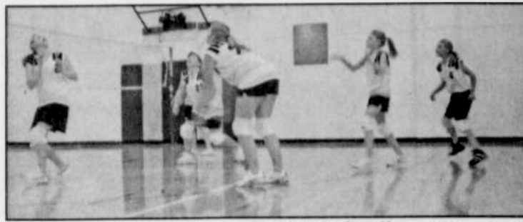
The Heppner Jr. High B team played at the Pendleton tournament on September 8.

The Mustangs have several home games with their next one this Friday, September 26, against Irrigon, and a tournament on Saturday, September 27, where Heppner will host several visiting teams for