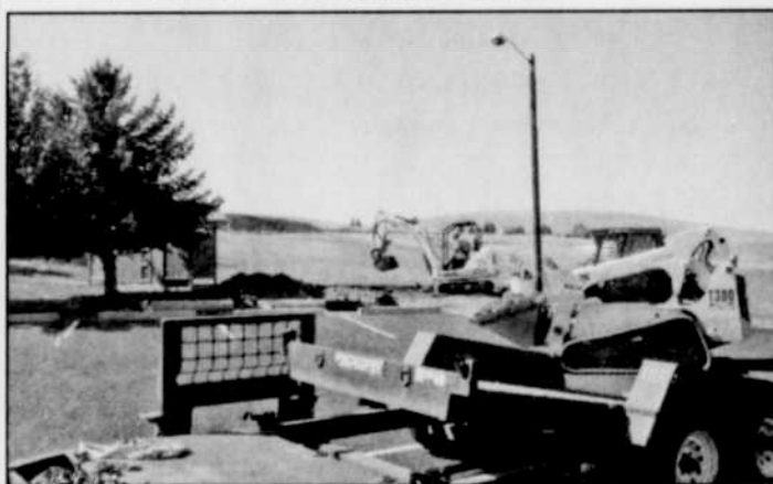
The Willow Creek Park District is putting in new bathrooms at the Willow Creek Lake. Concrete pre-fabricated bathroom will be put in on Thursday with a sidewalk around them.