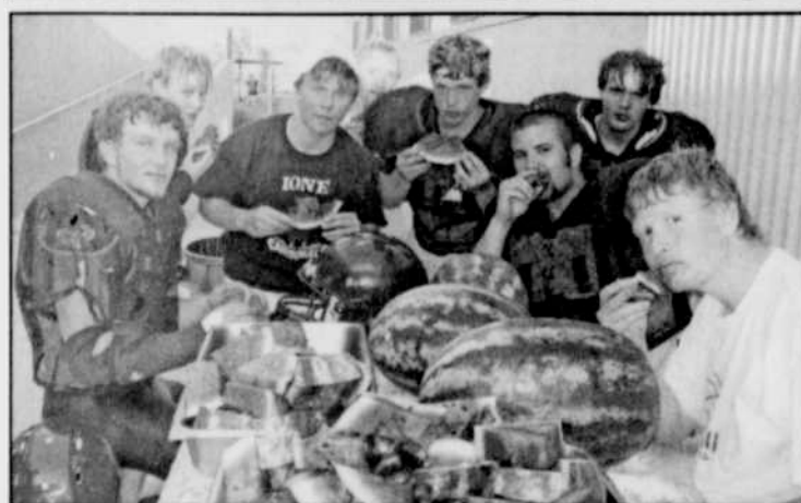
Football and volleyball players at Ione High School get rewarded with a watermelon feed after a daily double's practice. The Cardinal sports calendar can be found on the school website at www.ione.k12.or.us.