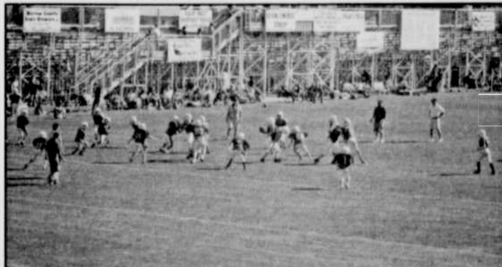
Saturday the Les Payne Field was swarmed with football players attending the Colt Jamboree.