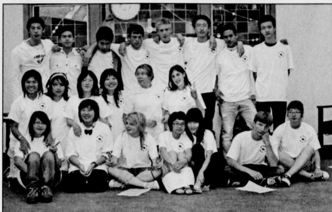
French, Chinese, South Korean and Thai students with their "Ione Cardinal USA" t-shirts.