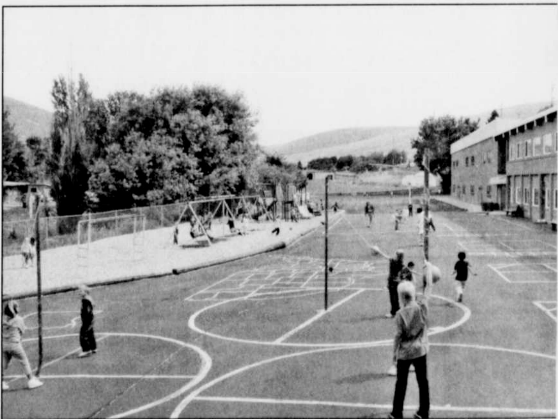
Students at Heppner Elementary School enjoy their recess time during their first day of school for the new year.

ALL NEWS AND ADVERTISEMENT DEADLINE: MONDAYS AT 5:00 P.M.