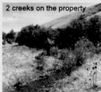
2 creeks on the property