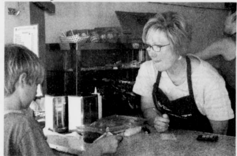
Young fairgoer gets something to eat at the Snack Shack

There will be plenty of food again this year at the Morrow County Fair with a variety of vendors.