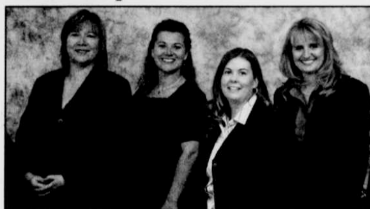
Pictured is BEO's mortgage team.

Anyone who has had to make do in temporary quarters knows the joy of being able to return to home base. Bank of Eastern Oregon's mortgage division shifted gears and set up a temporary office in the bank's multi-purpose room for approximately five months while the mortgage office underwent some necessary construction and repairs.