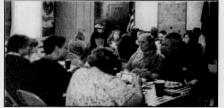
Ione School teachers enjoy a lunch provided by the Ione American Legion Auxiliary.

On July 11, 2008 the Ione American Legion Auxiliary hosted an appreciation luncheon for the Ione Schools teaching staff. Fifteen teachers were in attendance. A lunch of BBQ Ribs, coleslaw, fruit salad with cookies and pineapple sherbet was served.