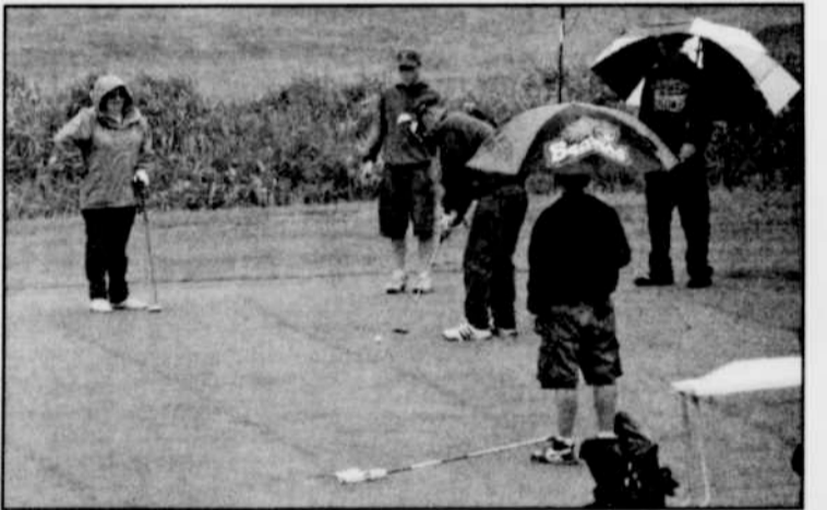
Golfers braved the rain on Sunday, May 25, to support the Babe Ruth baseball program in Heppner. Ten teams played 18 holes and then enjoyed lunch.