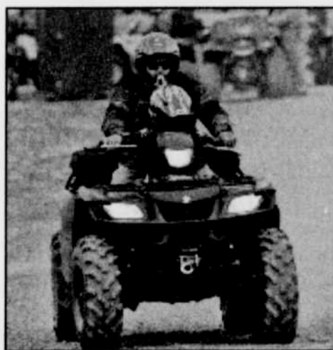
A couple of rides get ready to take to the trail.

With the weekend weather being bright, sunny and warm the event drew a large crowd of riders once again. There were approximately 260 riders who joined in on the 20 mile course around the OHV Park. Participants had the opportunity to see and experience some of new trails