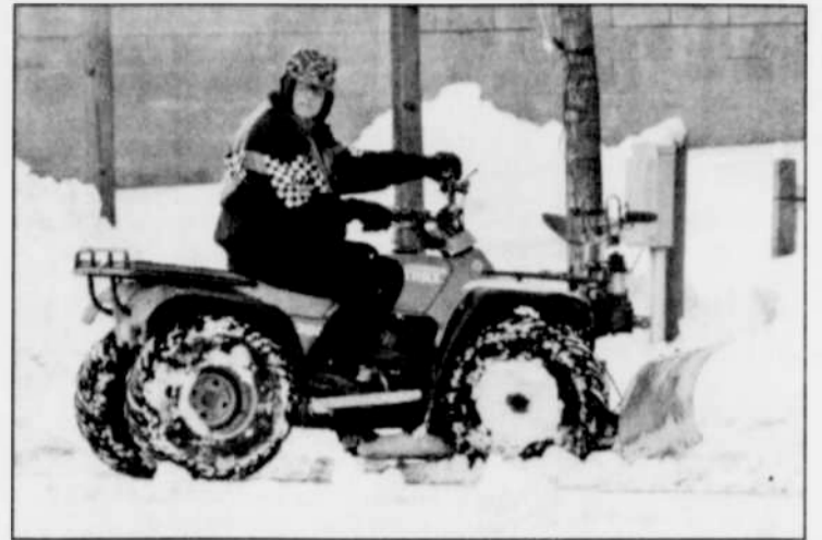
City is researching validity of ordinance which allows 4X4s and ATVs to drive on city streets.

Further discussion on the city ordinance revealed that to be in effect, signs must be posted around town and at the entrance