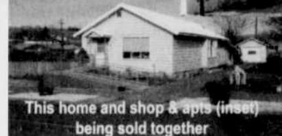
This home and shop & apt. (inset) being sold together

Home, plus shop & apartments across the street, only $220,000