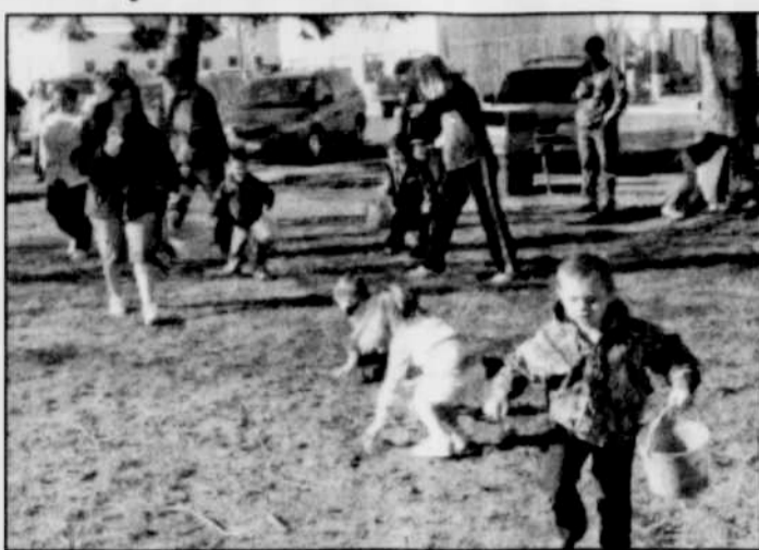
Children rushed to find Easter eggs last Saturday at the annual Easter Egg Hunt sponsored by the Heppner Elks Lodge.