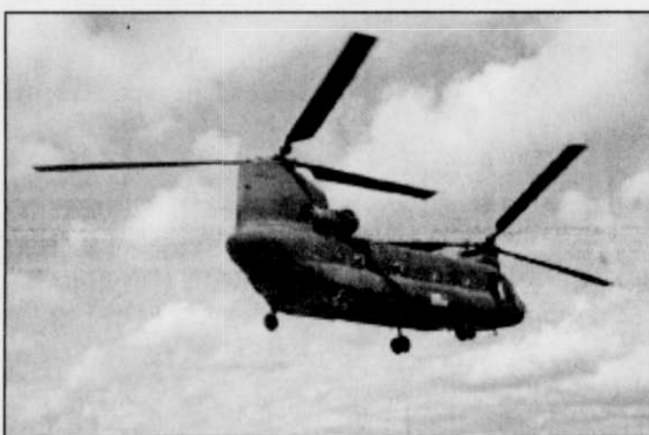
A Chinook helicopter from Pendleton landed at HHS last Tuesday. Students were able to tour the helicopter and as the soldiers questions.

The crew members of the Chinook slowed the