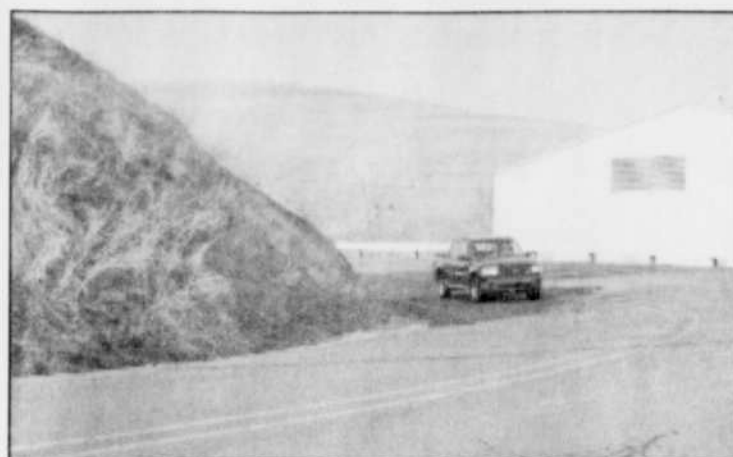
This sharp curve by Heppner Elementary School will be straightened out as part of the Court Street Project.

The east approach will need minor changes mostly by altering the existing fence and gateway to im-