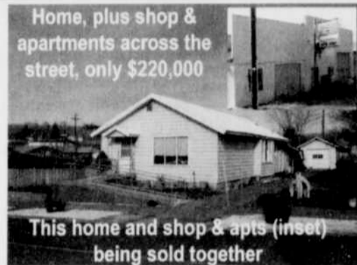
Home, plus shop & apartments across the street, only $220,000