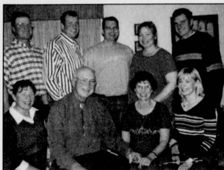
The Lindsay Family