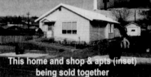
This home and shop & apts (inset) being sold together

Home, plus shop & apartments across the street, only $220,000