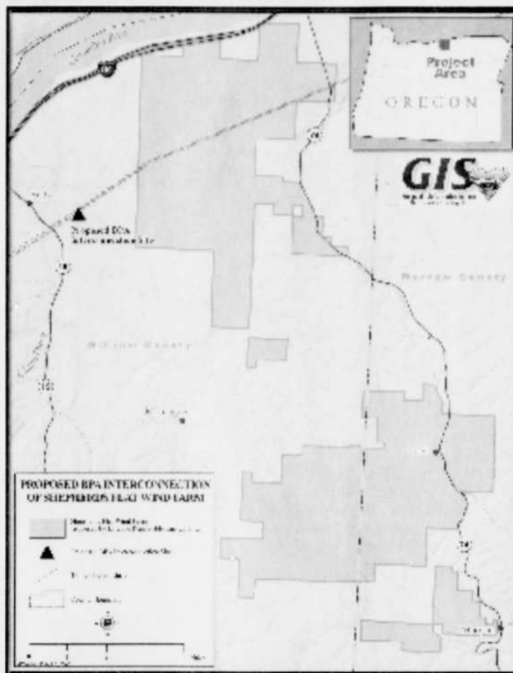
This map shows the project vicinity of the proposed Shepherds Flat Wind Farm.

Besides wind turbines, the facility will include 17 miles of above ground 230-kV transmission line, 103 miles of 34.5-kV collector transmission line (limited to 38 miles above ground), a communications system, two field workshops, two substations, six meteorological towers, and approximately 57 miles of new access roads. The turbine tower height would range from 263-345 feet and overall height (maximum blade tip height) would